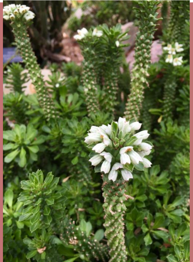
Matthaei Botanical Gardens (Ann Arbor)