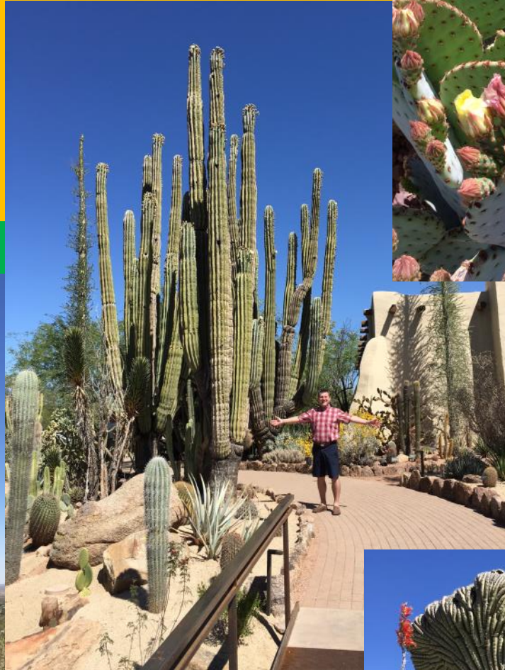
Desert Botanical Garden (Phoenix)