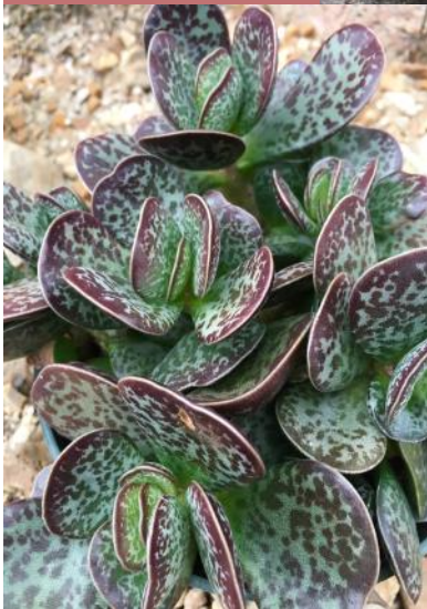
Kew Royal Botanic Gardens (UK)