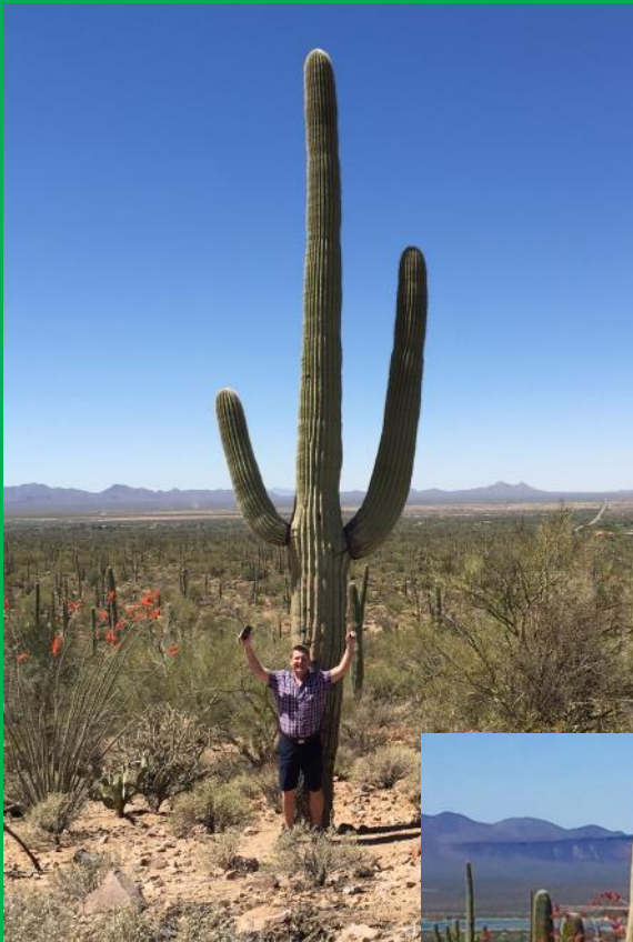
Saguaro National Park (Tucson)