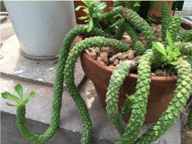
Brooklyn Botanical Gardens (Brooklyn)