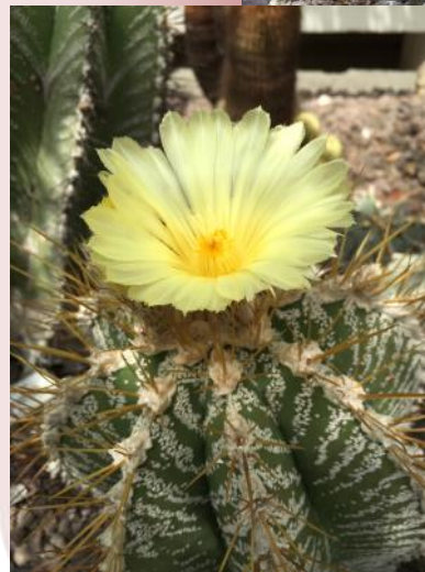
Orto Botanico (Rome, Italy)